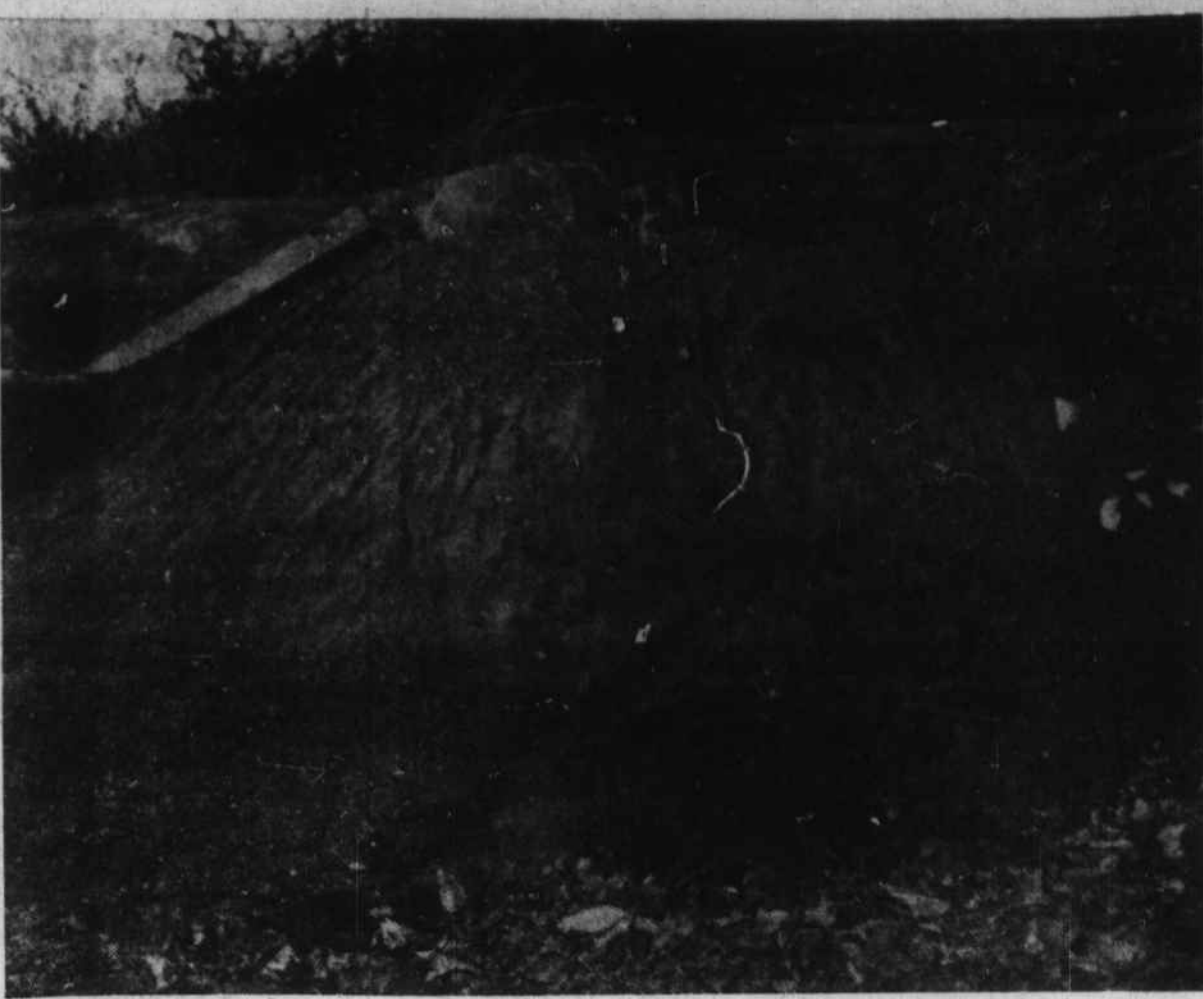
A SMALL mountain of dirt was removed from the trunk sewer line near the highway at Lake Junaluska. This came from one manhole, and is

He said a request for funds to increase the highway patrol by 100 men was being studied by the Advisory Budget Commission.