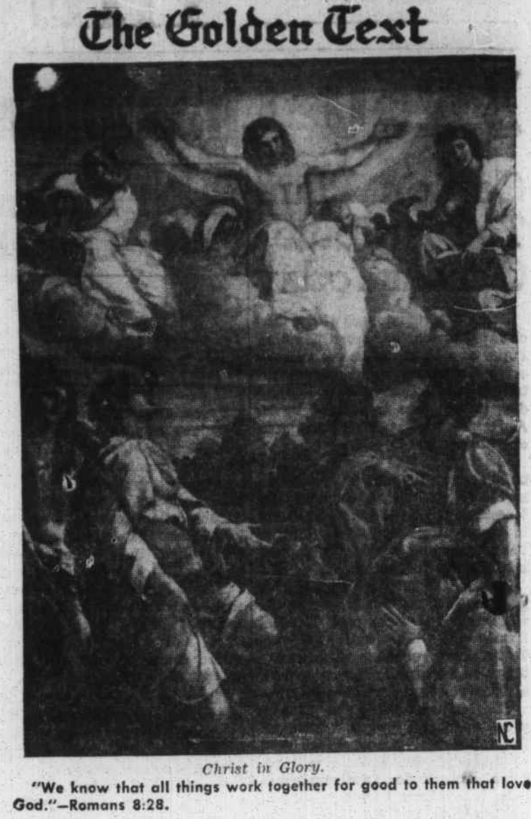
Christ in Glory. "We know that all things work together for good to them that love God."—Romans 8:28.

Simon Bolivar was liberator of six South American republics — Venezuela, Colombia, Ecuador, Panama, Bolivia and Peru.