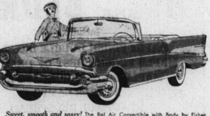
Sweet, smooth and sassy! The Bel Air Convertible with Body by Fisher.

Then, take the wheel and you'll find the going's even better than the looking! (Horsepower ranges up to 245.) * Come in and see.