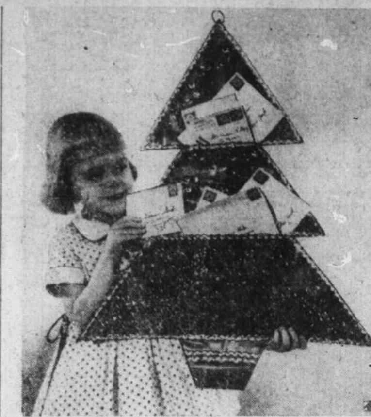
CHRISTMAS CARD TREE . . . Directions for making this and many other decorations are contained in one pattern envelope.

Let your imagination run riot on the matter of decorating the tree. Load up on beads, sequins and spangles from the dime store