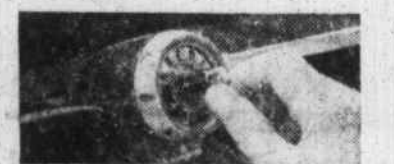
21. New Power Seat that "Remembers"