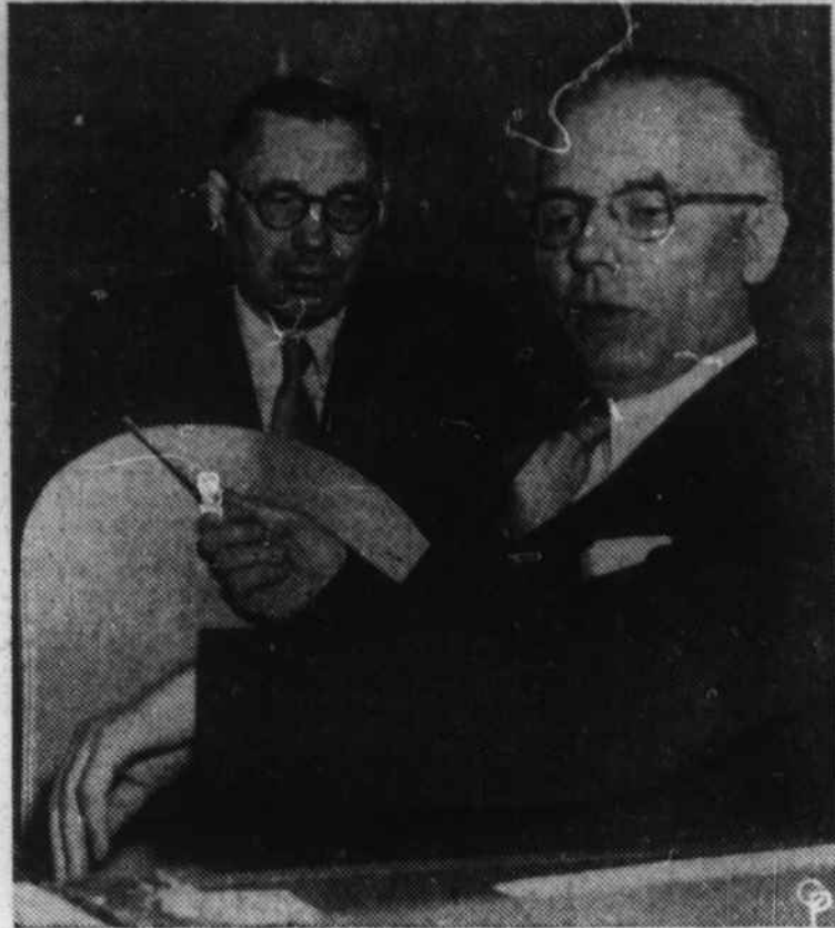
DESPITE PROTESTS from Imre Horvath (right), Hungarian Foreign Minister, the United Nations General Assembly in New York was urged by the United States and 13 other nations to demand that Russia and the puppet Hungarian regime allow U.N. observers in Hungary. Horvath, who is shown talking with Arkady A. Sobolev, Soviet representative, declared the U.N. was violating its charter provisions which rule out intervention in domestic affairs.