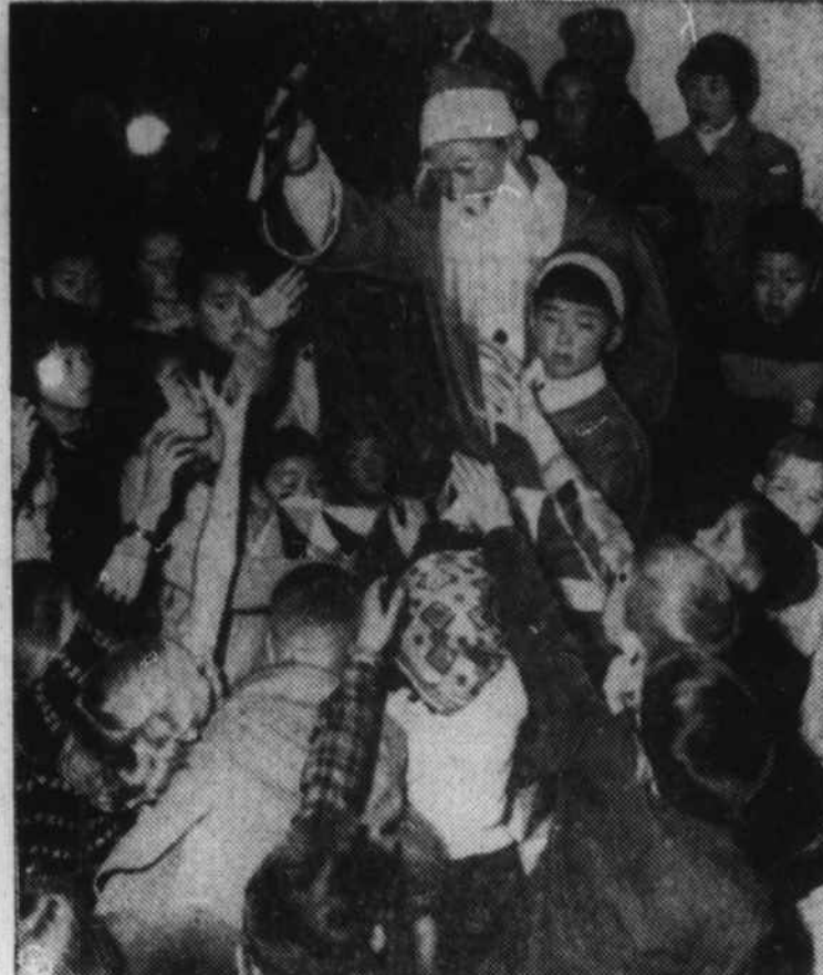
CHRISTMAS comes early at a Tokyo department store, where a Yuletide party is being held for a group of Japanese orphans. Also present were American school children. The youngsters are shown eagerly reaching for presents distributed by Santa.