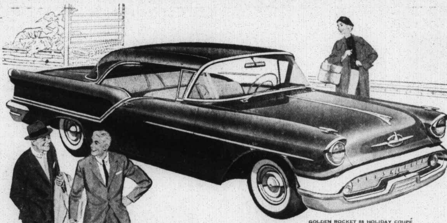
GOLDEN ROCKET 88 HOLIDAY COUPE

289 Main Street Dial GLendale 6-6258 70 Patton Ave. Dial 2-6376