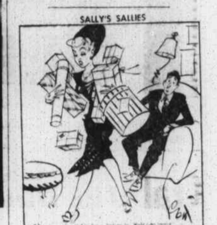
"Why look so upset, dear? I haven't started my Christmas shopping yet."

The Dayton girls have played only General Electric of Hendersonville in two WNC League games for a 2-0 record. Their WNC League Championship standing will not be contested again until after the first of the year since tonight is their last game until after Christmas.