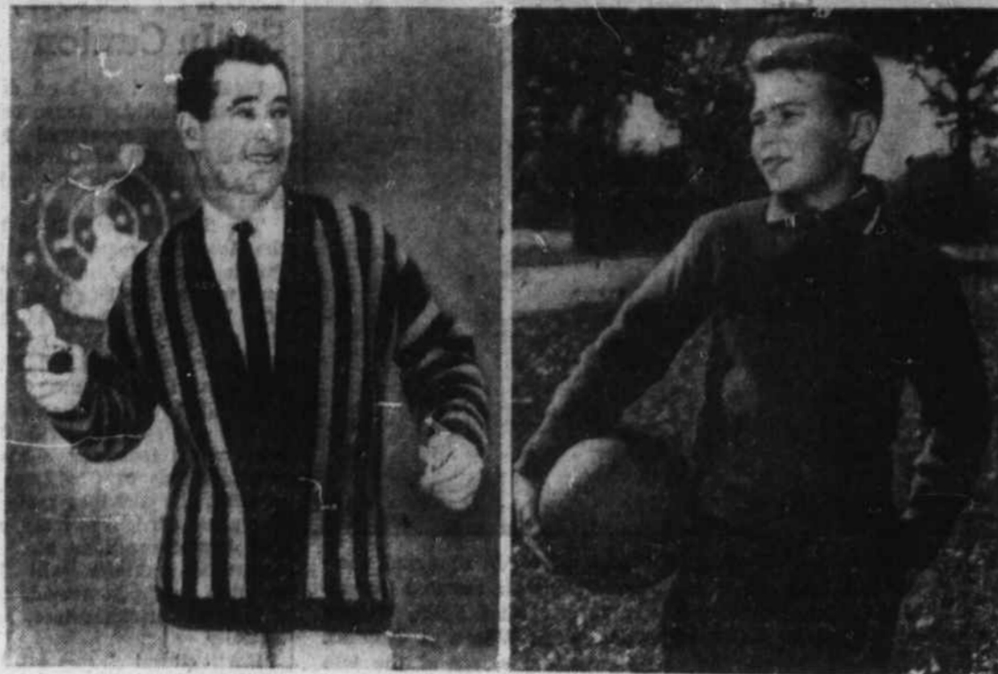
BLAZER FOR A GAY BLADE . . . Bulky wool sweater coat in bold stripes and shaker stitch. FROM SANTA TO JUNIOR . . . Crew-neck sweater, convertible collar.