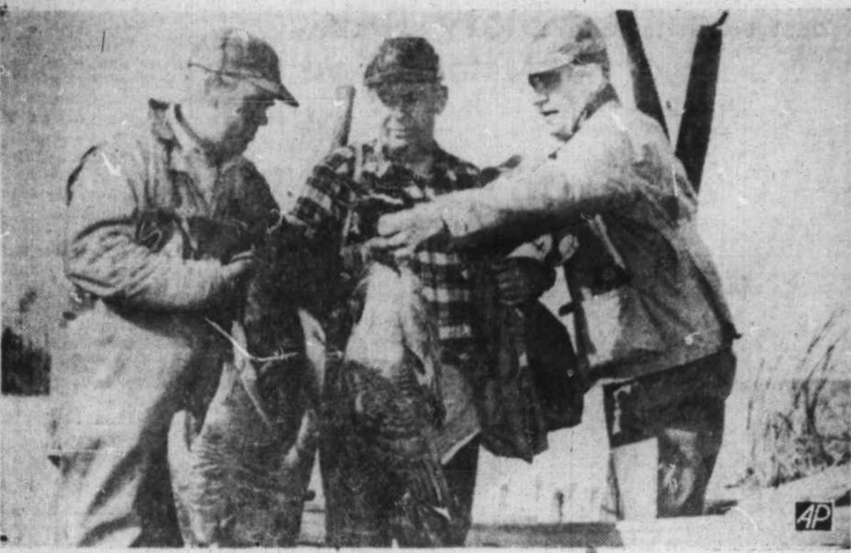
THE GOVERNORS find good goose hunting—ing at Lake Mattamuskeet. Their guide (left) Gov. Marvin Griffin of Georgia (center) and Gov. Luther Hodges of North Carolina (right) unload their bag of wild geese after a day of fine hunt-