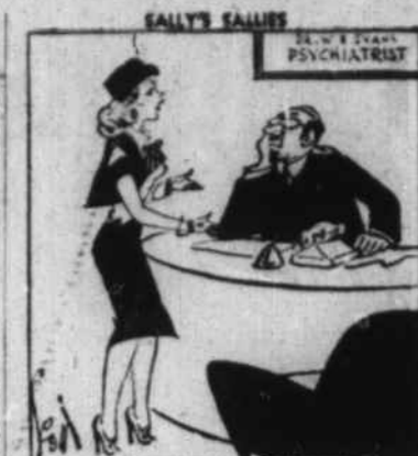
"I know all that, Doctor, but I prefer to live in a dream world."

NAPA, Calif. (AP)—A workman jumped from an intersectional pedestrian island just in time to escape a car that knocked down a traffic light standard. The workman had just replaced the standard, smashed by another vehicle 24 hours earlier.