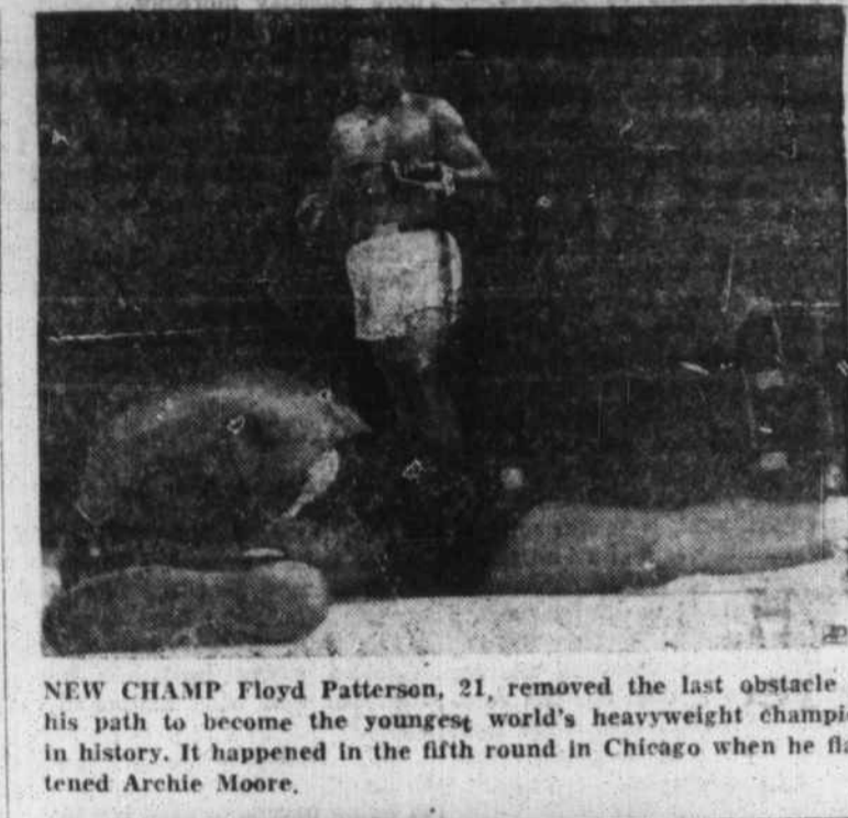
NEW CHAMP Floyd Patterson, 21, removed the last obstacle in his path to become the youngest world's heavyweight champion in history. It happened in the fifth round in Chicago when he flattened Archie Moore.