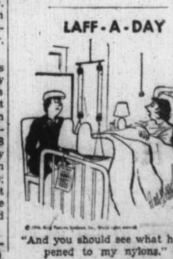
"And you should see what happened to my nylon."

DECEMBER 13 — Crabtree girls upset Bethel Belles, 29-28, but Blue Demons triumph, 59-36; Fines Creek girls top Clyde, 48-35, while Cardinals win, 61-37; Waynesville takes twin bill from Brevard, 43-