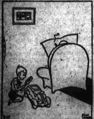
"Pop, what is gumption?" "An oldster's staff."

here and wait for you," declared Billy Mink. "You may just as well come out now as to keep me waiting, because you are going to be caught anyway and I am going to catch you."