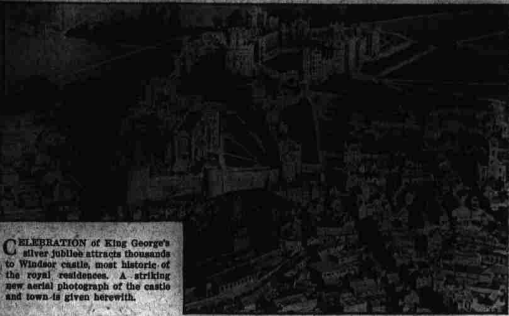
CELEBRATION of King George's silver jubilee attracts thousands to Windsor castle, most historic of the royal residences. A striking new aerial photograph of the castle and town is given herewith.