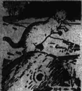
You'll have to come out some time and I'm going to stay right here and wait for you," declared Billy Mink.

DANNY MEADOW MOUSE was trapped. He was trapped, but not caught, which sounds rather mixed and isn't at all. You see he was trapped because Billy Mink was waiting for him just outside the only doorway to that hollow log in which he was hiding. But he wasn't caught, because that doorway was too small for Billy Mink