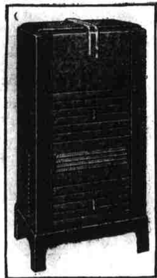
The Spirit of Progress Model is only one of the 3 styles of oil burning Heatrolas. Come in and see them all.

Because there are sizes for every room and every home—and all at moderate prices.