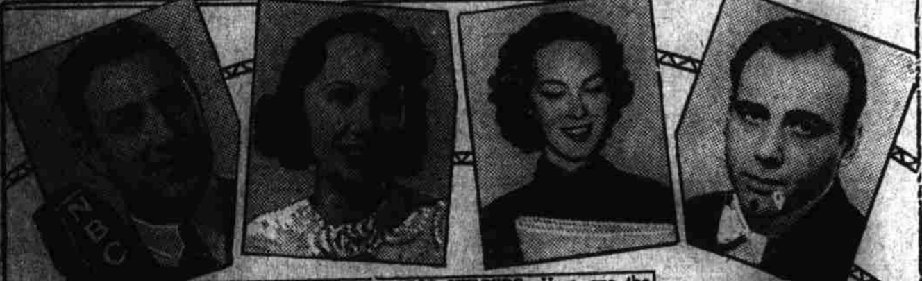
FRED ASTAIRE'S MUSICAL HELPERS —Here are the four featured musical artists heard with debonair Fred Astaire in his Tuesday night broadcast over the NBC-Red network. They are, left to right, Conrad Thibault, baritone; Francis White, soprano; Trudy Wood, blues singer, and Johnny Green, composer-pianist-conductor.