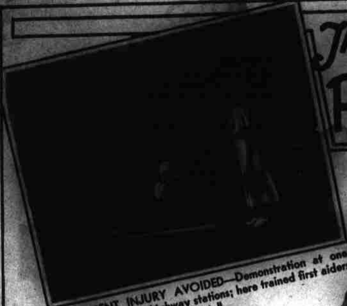
PERMANENT INJURY AVOIDED —Demonstration at one of 1,600 Red Cross highway stations; here trained first aiders help to reduce accident death toll.