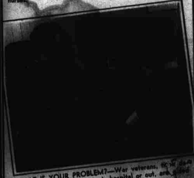
WHAT IS YOUR PROBLEM? —War veterans, dependents, and service men, in hospital or out, are aided by Red Cross in solving their difficulties.