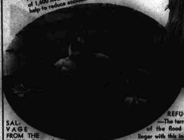
SALVAGE FROM THE FLOOD —Boy and dog view the family's worldly goods piled on river bank where Red Cross found them, provided shelter and care.