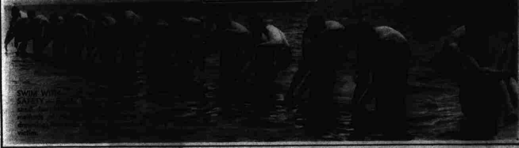
SWIM WITH SAFETY —