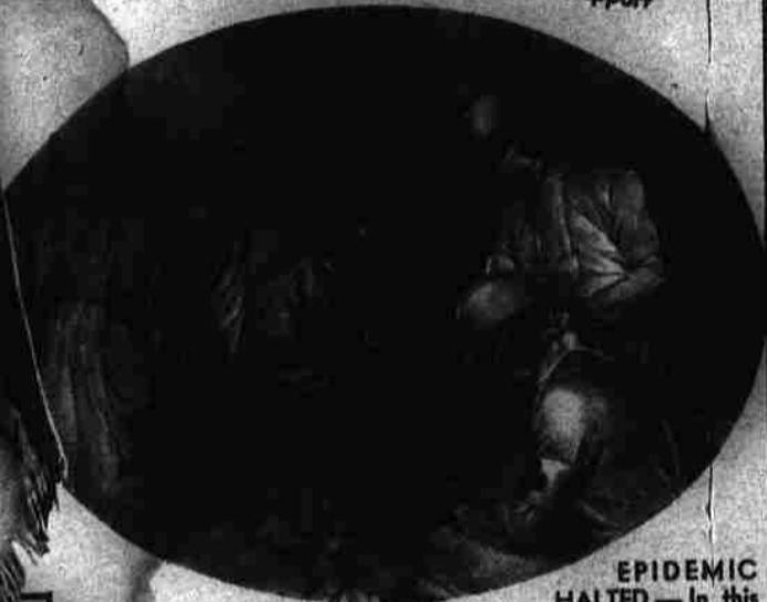
EPIDEMIC HALTED —In this Red Cross field hospital, typical of 281 in flood area, a meningitis epidemic was averted by Red Cross doctors and nurses.