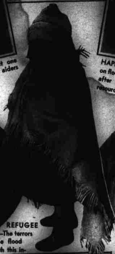
REFUGEE —The terrors of the flood linger with this infant, rescued by Red Cross.