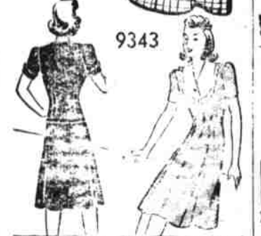
Pattern 9343 may be ordered on 14 misses' sizes 12, 14, 16, 18 and 20. Size 16 requires 2 1/2 yards 35-41 inch fabric. 1 1/2 yards tulle.

Send SIXTEEN CENTS in coins for this Marian Martin pattern. Write plainly SIZE, NAME, ADDRESS, STYLE NUMBER.