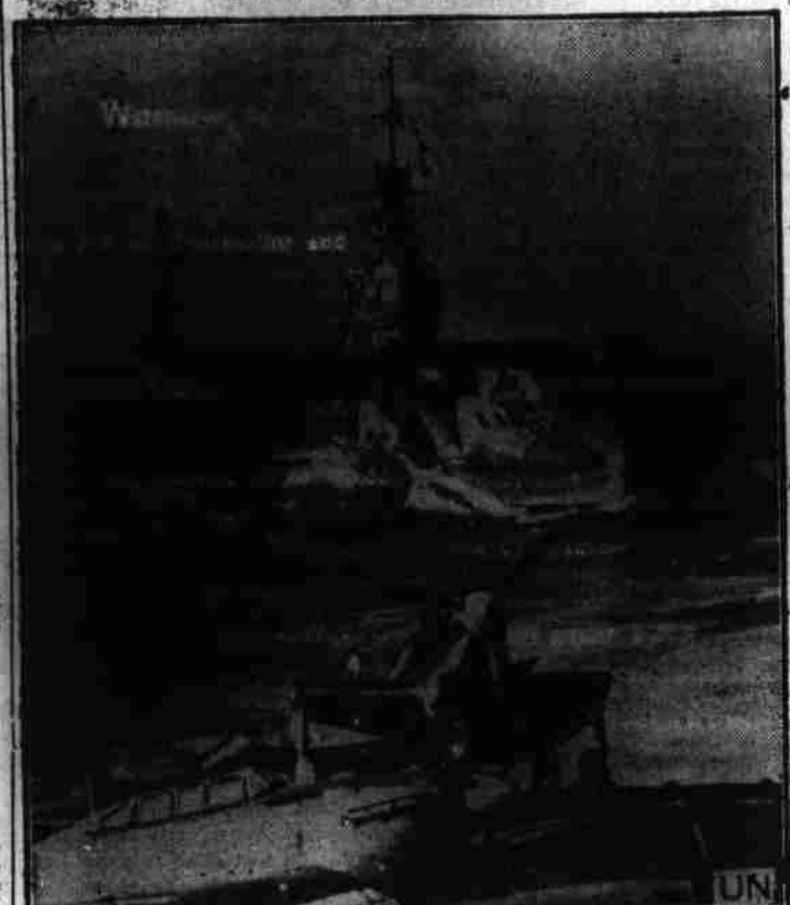
MODERN NAVIES USE AIR POWER right along with the big guns of battleships. This striking new picture shows a formidable force of British aircraft carriers acting as part of an escort of an important convoy in the Mediterranean.