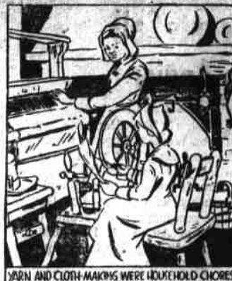
Wool and cloth making were household chores. While manufactured textiles had to be imported.

IN the days of our Republic's infancy, while Revolutionary War battle sounds and the Liberty Bell's tolling still echoed through the land, Americans were stirred by a zeal for economic independence equaling their love of political freedom. Symbolic of the determination to establish industries on United States soil, the Massachusetts legislature voted funds to stimulate textile manufacturing. In such ways were planted the first seeds of America's second greatest industry.