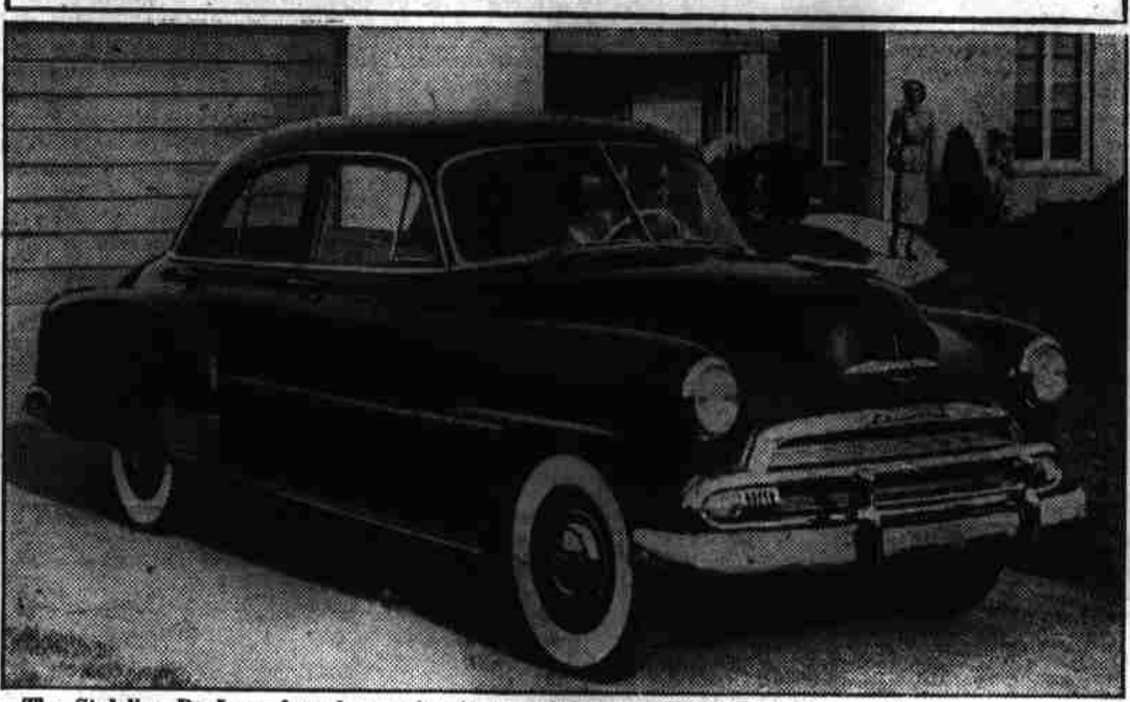
The Styleline De Luxe four-door sedan is one of lower appearance. Radiator grilles have been simpli-14 models introduced by Chevrolet as its passenger fied, the decorative body moulding lowered and car line for 1951. Notable in this picture are the design improvements which accentuate a longer, safety.

N = 1 hevrolet FINEST LOW-PRICED LARGEST AND