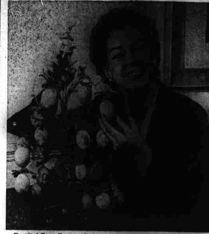
Rosalind Russell, star of stage, screen, and radio, borrowed from Old World folk-lore the idea of decorating an Easter egg tree at Easter time. Decorating trees with gaily-colored eggs at this season once was a cherished family custom in many localities of Europe, according to the Poultry and Egg National Board. Miss Russell, currently starring in "Bell, Book and Candle" in Chicago, said she finds it is "just as much fun and more practical" in her case to adapt the idea of an Easter egg tree as a centerpiece.