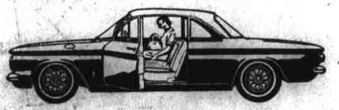
New CORVAIR MONZA CLUB COUPE Here's the family man's sports car with bucket seats up front and the famed handling ease that stems from Corvair's air-cooled rear engine.