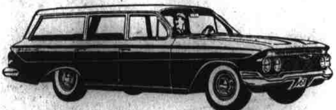
New 9-Passenger BROOKWOOD STATION WAGON There are six Chevrolet wagons, luxurious Nomads—each with cargo from budget-wise Brookwoods to opening nearly 5 ft. across.

JET-SMOOTH CHEVROLETS , nimble Corvairs, the one-and-only Corvette-31 models in all to choose from under one roof at your Chevrolet dealer's. Thrifty full-sized Chevrolet Biscaynes, popular Bel Airs, sumptuous Impalas, six handy, handsome wagons. Agile, sure-footed Corvair sedans and coupes and family-lovin' Corvair wagons. Why not drop in and do your new car shopping in just one stop!