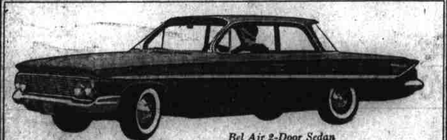
CHEVROLET'S GOT MORE OF WHAT IT TAKES ... and that's why more people are taking to it. That built-in Jet-smooth ride, for instance, with Full Coil suspension. Body by Fisher refinements unmatched in Chevy's field. And so many more things to like! No wonder Chevrolet's the most popular on the highway and buy-way!

See the new Chevrolets at your local authorized Chevrolet dealer's JONES CHEVROLET COMPANY INC. WARSAW MOTOR COMPANY Authorized Chevrolet Dealer in Park Hill, N. C. in Warsaw, N. C. 101 E. College Street Manufactures License No. 110