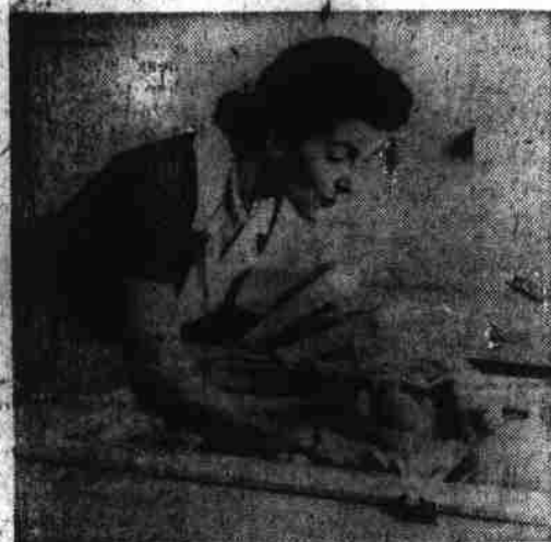
MONEY FOR NEW APPLIANCES