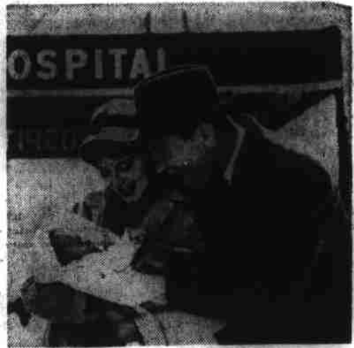
MONEY FOR NEW BABIES