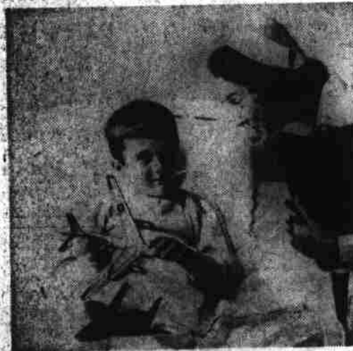
MONEY FOR MEDICAL BILLS