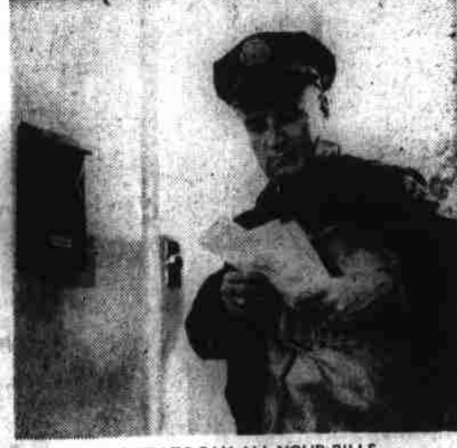
MONEY TO PAY ALL YOUR BILLS