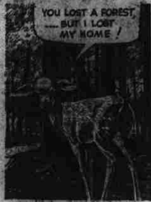
Please be more careful!

* Every pool owner should consider taking a Red Cross life saving course. If there is a teenager in the family, he or she also should be trained.