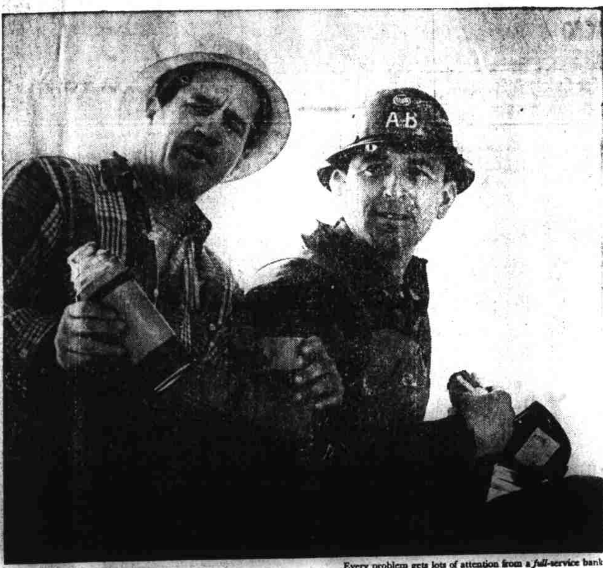
Every problem gets lots of attention from a full-service bank