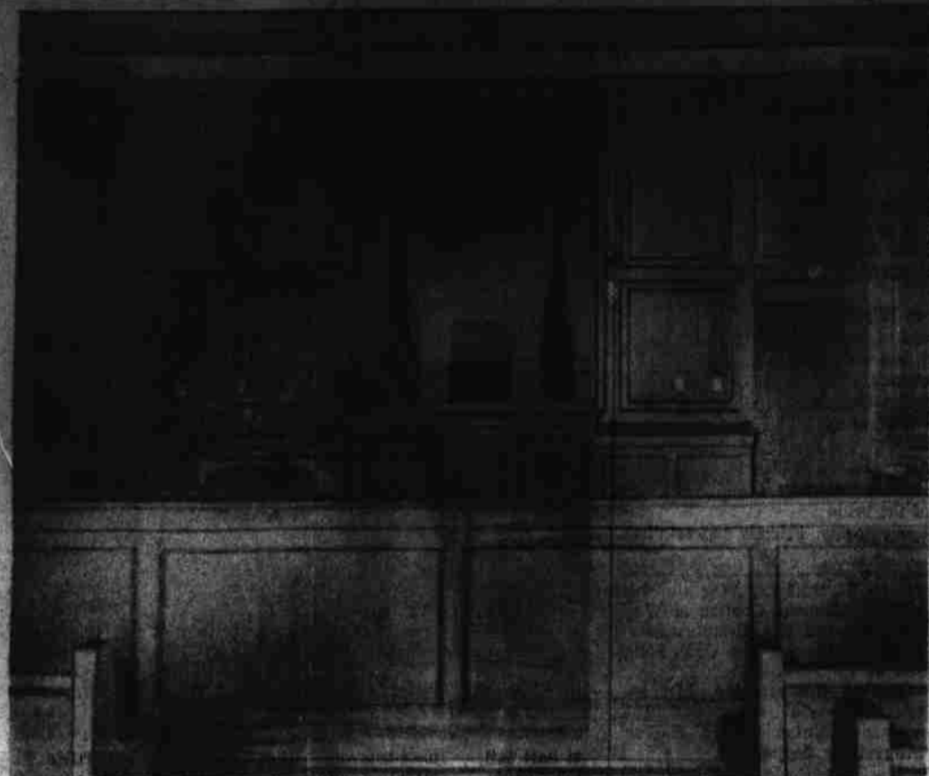
ANOTHER VIEW of the newly renovated Court Room in the Duplin County Court House. In this view is shown the Judges' Bench, the witness stand, the Clerk's desk and the Stenographer's Desk. The Bar Rail, is of African Mahogany, the same as the judge's bench and the panelling. Also seen are the benches in the auditorium.