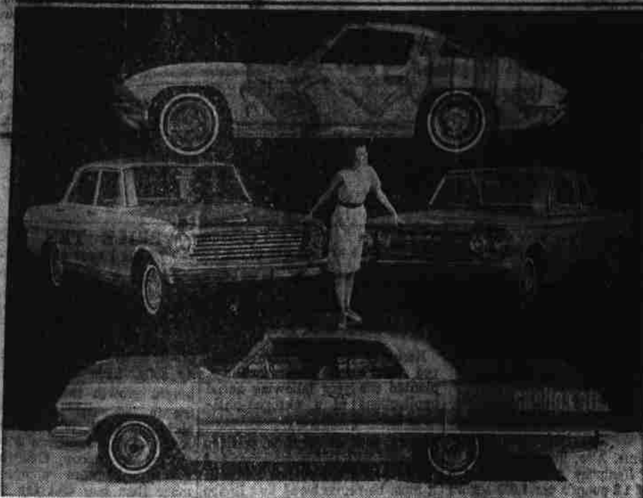
Chevrolet's parade of new products for 1963 includes four lines. Heading the list, which will be announced on September 28, is the luxurious Impala Sport Coupe (bottom), Chevy II 4-Door Sedan (left center), Corvair Monza Club Coupe (right center), and the new and startling Corvair Sting Ray Sport Coupe, the epitome of advanced styling. Chevrolet's wide choice of passenger cars includes 33 models in addition to 6 variations with special optional power-train combinations.