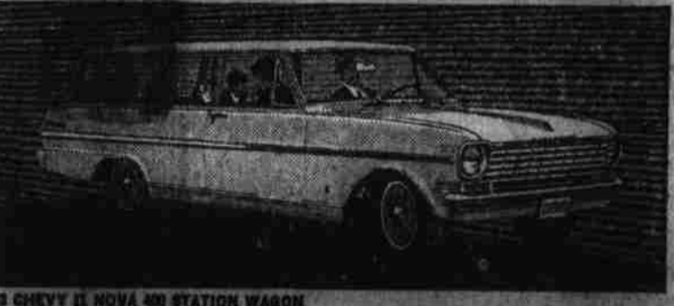
'63 CHEVY II NOVA 400 STATION WAGON