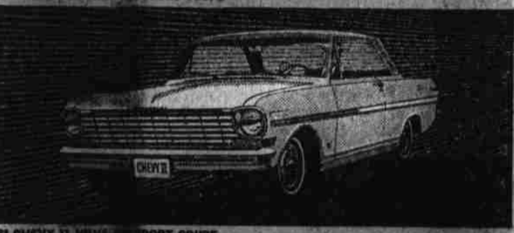
'63 CHEVY II NOVA SPORT COUPE