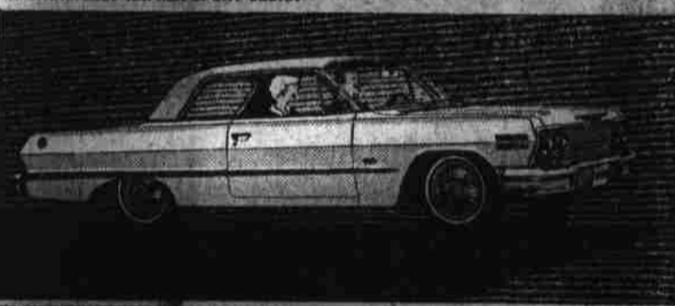
'63 CHEVROLET IMPALA SPORT COUPE