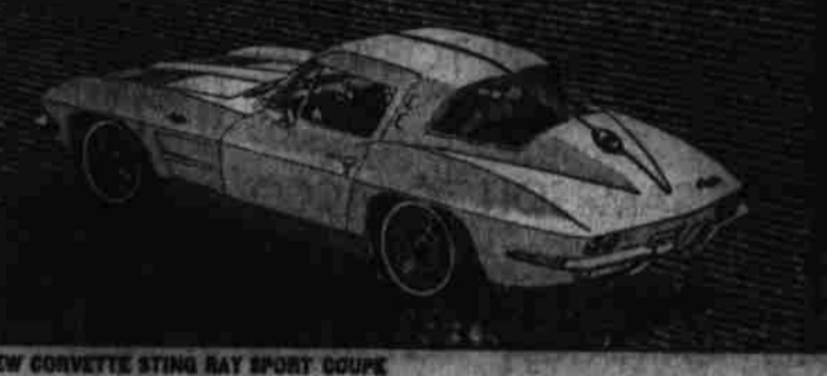
NEW CORVETTE STING RAY SPORT COUPE