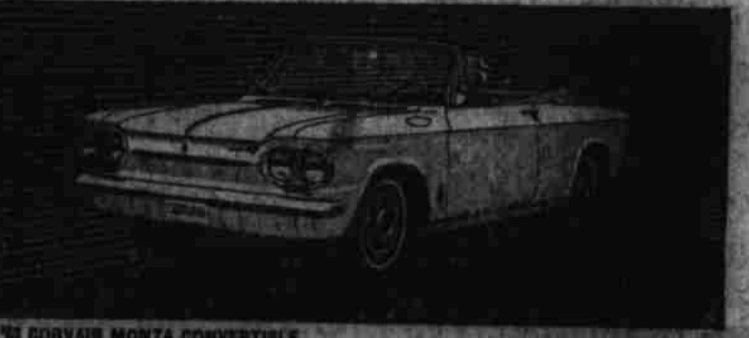
'63 CORVAIR MONZA CONVERTIBLE