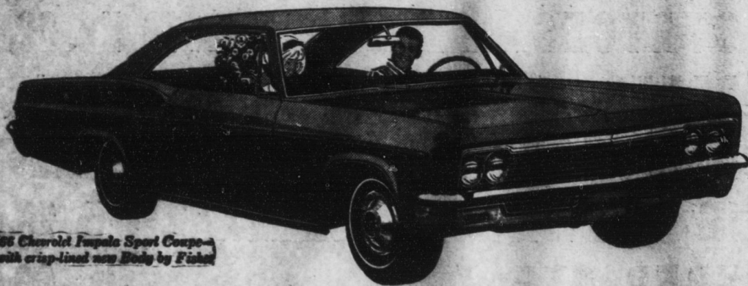
'66 Chevrolet Impala Sport Coupe with crisp-lined new Body by Fisher

1. NEW TURBO-JET V8's. Three versions of this remarkably efficient engine are available, with ratings of 325 hp, 390 hp and 425 hp. 2. RICHER NEW INTERIORS. They're impressive even by Impala standards. And the fine hand of Body by Fisher craftsmen-