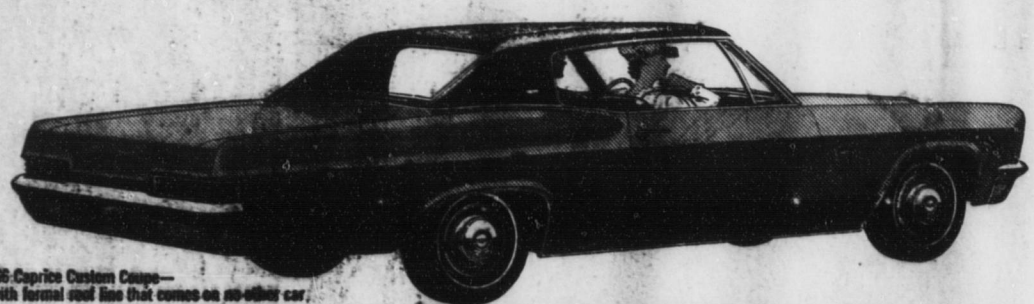
'66 Caprice Custom Coupe - with formal roof line that comes on no other car.

A whole new series of elegant Chevrolets with a whole new choice of features even some of the most expensive makes don't offer