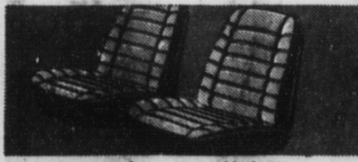
Strato-bucket seats featuring tapered backrests come with console shown at left