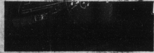
Specialty instrumented console, with the rich look of oak, is available for the Custom Coupe

A whole new series of elegant Chevrolets with a whole new choice of features even some of the most expensive makes don't offer