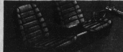
Strato-back front seat, available in Custom Coupe and Sedan, has center armrest that folds up for third person