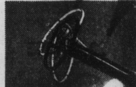
Tilt-telescopic steering wheel in '66 or down, in or out, can be added to any model

All told there are 200 ways you can pile luxury upon luxury in the '66 Caprice Custom Coupe, Sedan or Wagon. And that includes creature comforts like four-speaker FM stereo. But the beauty of it is that a Caprice, before you add the first extra, is luxurious above and beyond any other Chevrolet you've ever seen - and many a more expensive make, too. Ready to move up this year? Your Chevrolet dealer is now ready to move you up about as far as you could want to go.