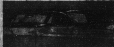
Vinyl roof cover is available. Outside rearview mirror is one of many safety assists standard on all '66 Chevrolets