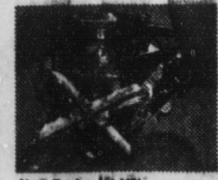
New Turbo-Jet V8's are available with up to 425 hp