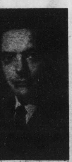
Congressman Bill Brock

Congressman Bill Brock was born in Chattanooga, Tenn.