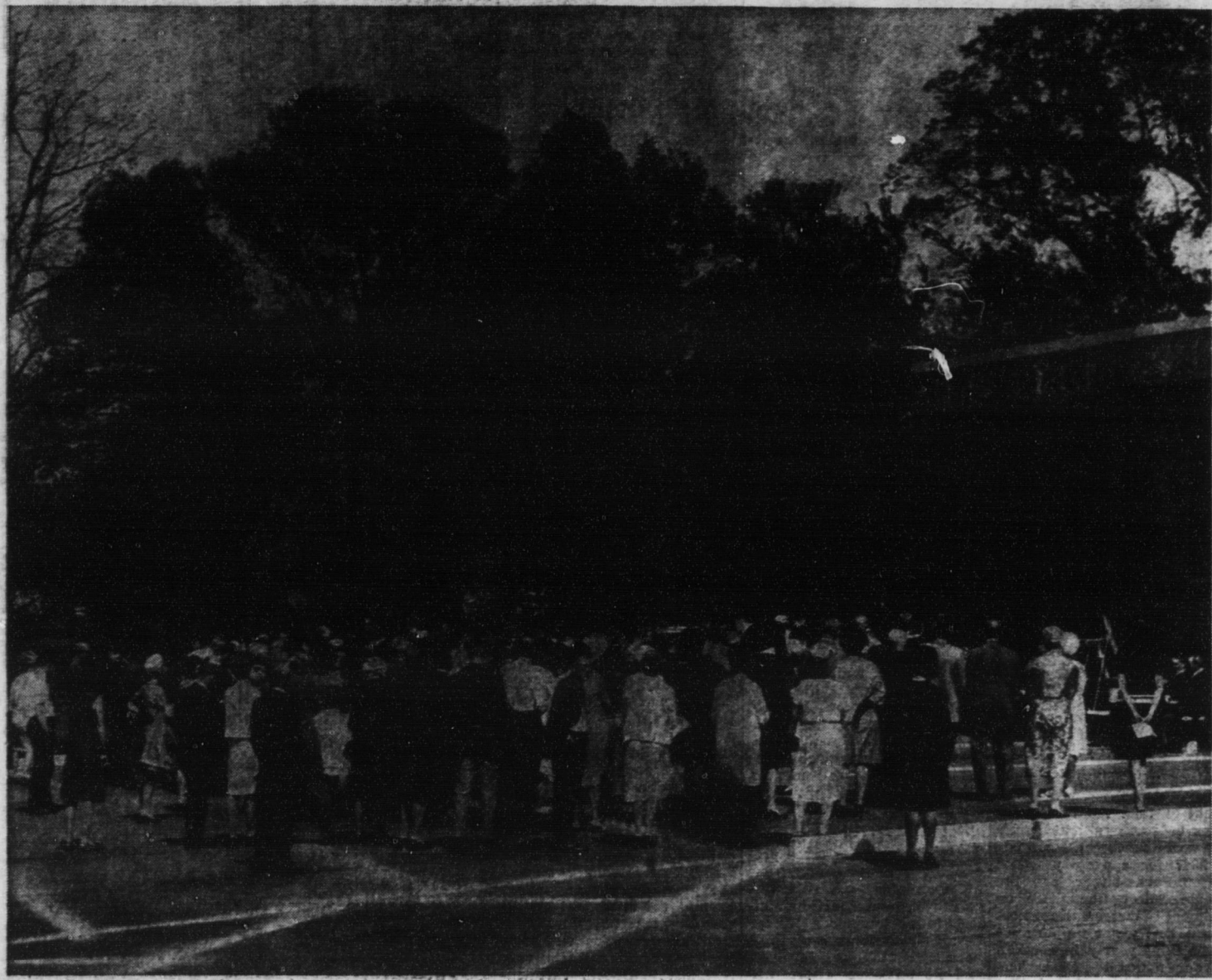
NEW LIBRARY IS DEDICATED FOR DAVIE COUNTY —The Dedication and Formal Opening of the Davie County Public Library, Main Street, Mocksville, took place on Sunday, April 24, 1966 at 2 P. M. During the afternoon around four hundred guests were shown through the new building, and told of the services offered by the library. Much interest was expressed by visitors, many of whom were librarians and friends from outside Davie County. Representatives of the press and the local radio station WDSL were helpful in giving excellent coverage of the event...

COOLEEMEE, N. C., THURSDAY, APRIL 28, 1966