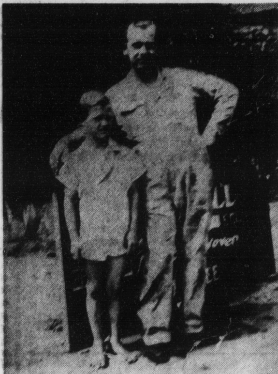
WHO IS THIS YOUNG MAN AND HIS PAL? (Clues: Both Are Local Residents.)

COOLEEMEE, N. C., THURSDAY, AUGUST 11, 1966