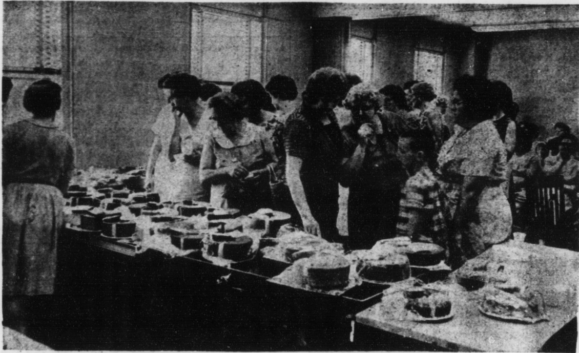
Spectators crowd around table of cakes after judging in Davie County.

COOLEEMEE, N. C., THURSDAY, AUGUST 25, 1966