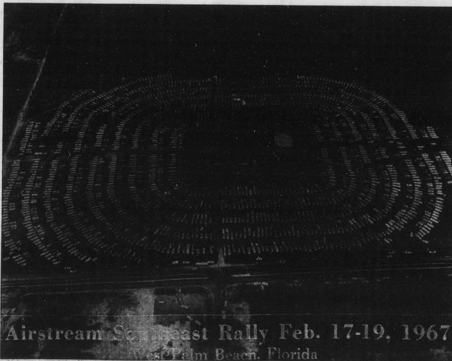
Airstream Southeast Rally Feb. 17-19, 1967 West Palm Beach, Florida

Mr. and Mrs. Bryan Sell have returned to their home in Mocksville after two months vacationing in Florida. This is an aerial view of the approximately 2,000 trailers that brought more than 4,000 persons to West Palm Beach for the annual Southeastern Airstream Trailer Rally February 17-19. The shiny trailers are parked around a huge tent which had been set up at the campsite just east of the Sunshine State Parkway. The rally included games and entertainment for the mobile set. There were three shows daily. For one performance, a special troupe of Broadway stars from New York City were flown in for a professional variety show. On Sunday church was held in the tent with nearly 4,000 attending. Twenty-four ushers collected donations amounting to almost $2,000 which was given to a charitable institution there. Mr. Sell was one of the ushers at the service. A western beef barbecue was served during the rally.