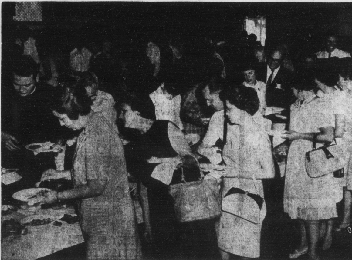
BANK HOSTS DINNER — On Thursday, June 15th, the Central Bank and Trust Co. of Cooleemee was host at a luncheon at the Woodleaf School Gymnasium. This is the seventh year which has become a tradition with them. No planned program, just good food and fellowship. The ladies of Woodleaf prepared the food.