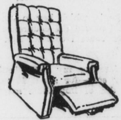
"All work guaranteed"

Prices reasonable Free Estimates N. C. License 225928