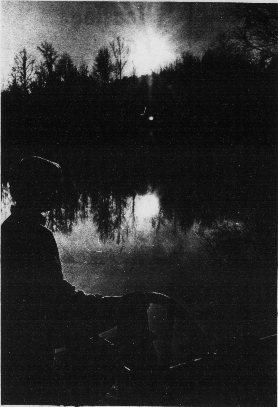
A double sunset is seen by this lad near the flood gates at the Cooleemee dam.