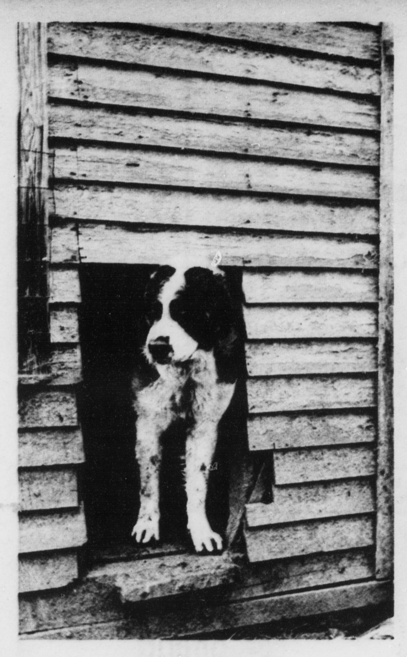
Jody weighs over 200 pounds