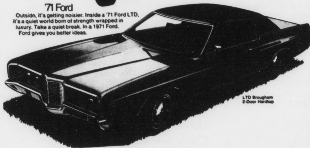
LTD Brougham 2-Door Hardtop

How does a nice homegrown Mustang stand up to the great road cars of Europe? Beautifully. With great looks and handling, at a fraction of the cost. With six models, seven engines and a long, long list of options.