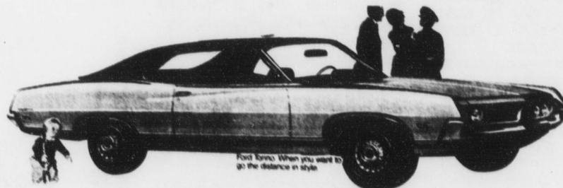
Ford Bronco. When you want to go the distance in style.