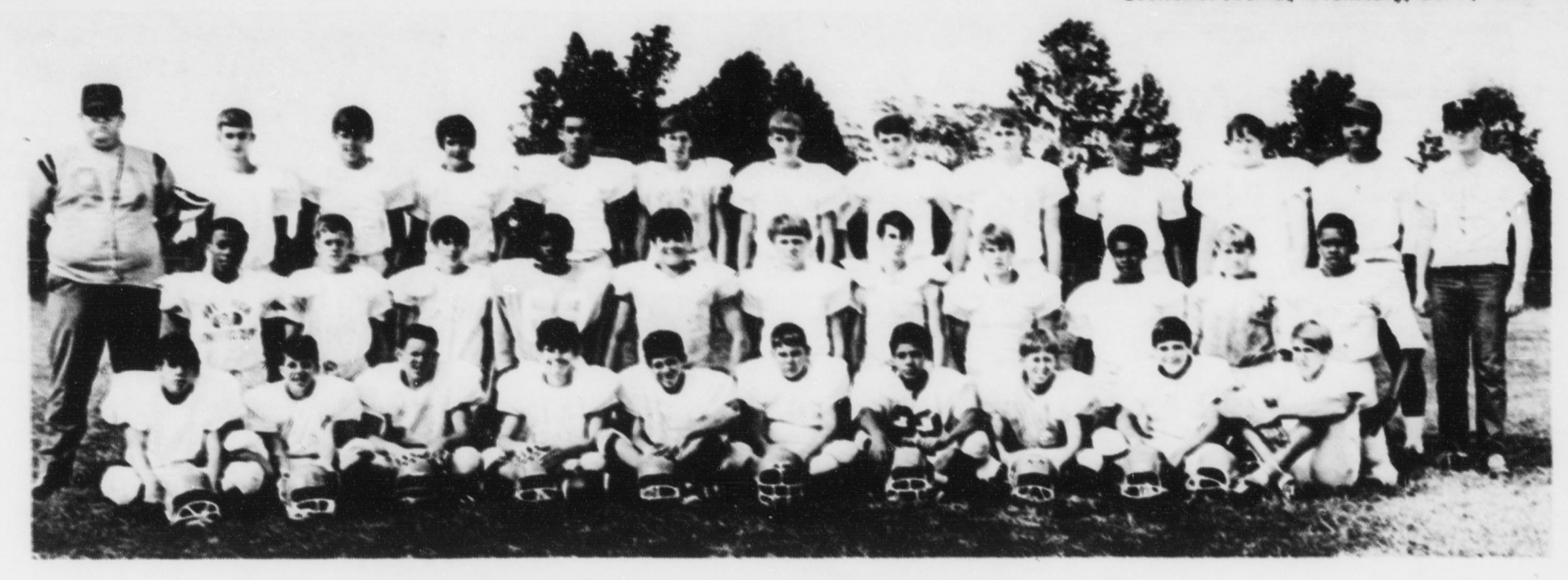
Davie High Freshman Football Squad