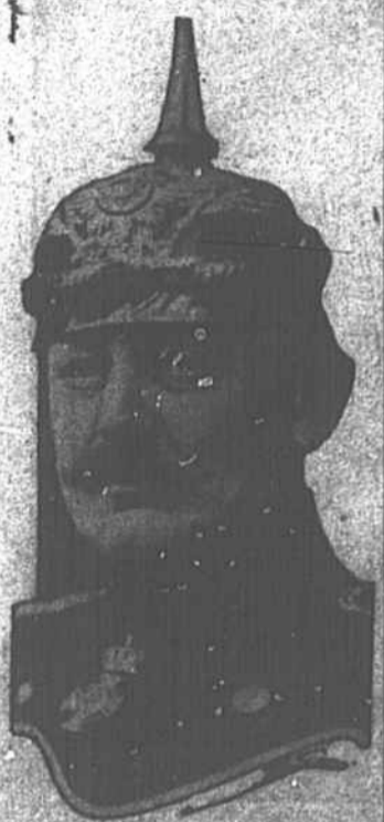
Count von Moltke, commander-in-chief of the German army.