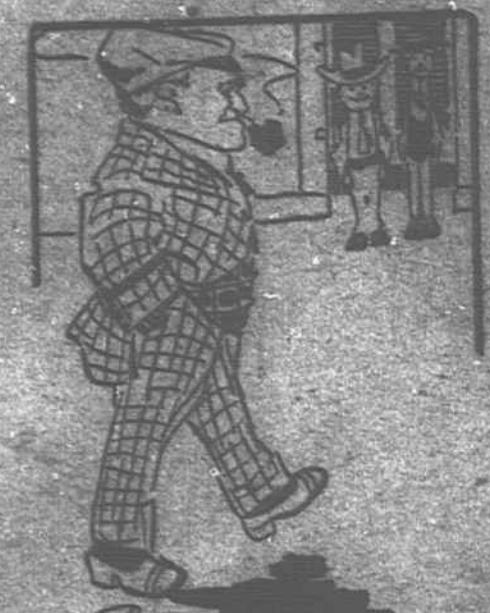
Do you think he'll be able to land a job? Well, he worked his way through college.