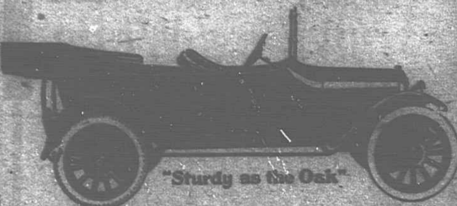
"Sturdy as the Oak"

Body—Five-passenger touring car, two passenger roadster Motor—Oakland-Northway, six-cylinder.