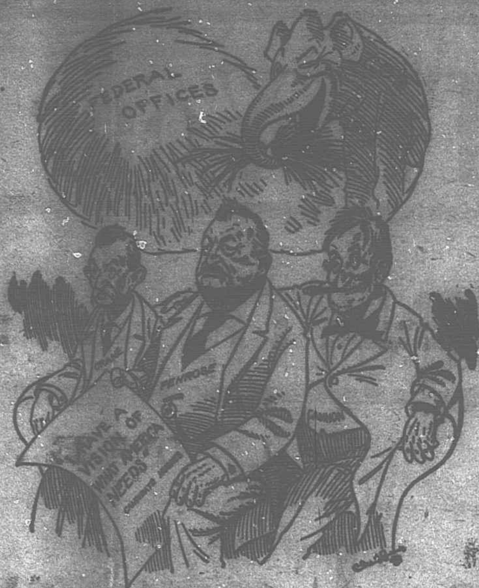
"So Have We."