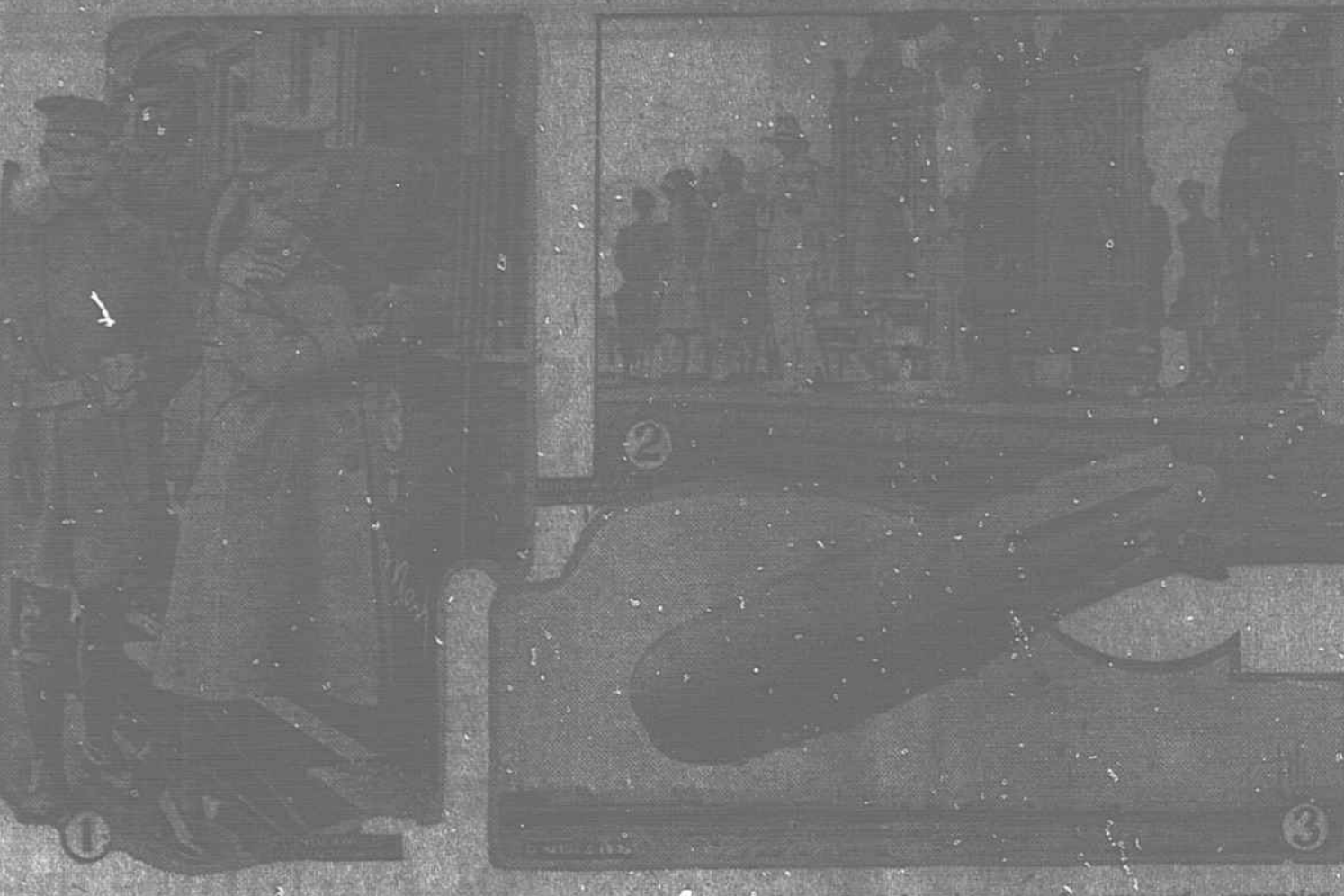
1—Yankee doughboy bidding his German sweetheart farewell as first detachment of army of occupation was leaving Coblenz for home. 2—Prince of Wales replying to municipal address at Bombay, India. 3—Dirigible Roma, purchased from Italy, arriving at Bolling Field, Washington.

Wishes. "I wish I were a girl," said the boy. "I wish you were a boy," said the girl.