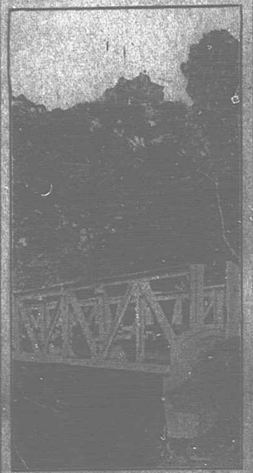
Army Sectional Bridge Erected Over Davidson River, Pisgah National Park.

A compilation showing total deliveries of war material to the various states up to July 1, last, places the value of machinery, equipment and supplies so delivered at $30,843,770; of motor vehicles, $74,730,568; and of spare parts, at $11,731,424. The total value of deliveries to the states up to that date was $117,110,771. That figure did not include material to the value of approximately $11,000,000, which was retained by the Department of Agriculture, largely for forest road