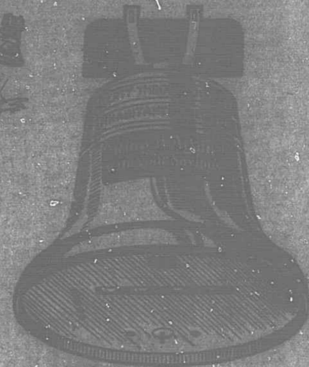
Ring the Liberty Bell NOW means YOUR independence in future years.

JUST as the ringing of the Old Liberty Bell on July 4, 1776, meant Liberty, Freedom and Happiness "to all inhabitants throughout the land," so will the "ringing" of the Liberty Bell Bank with the savings of your children NOW , mean THEIR independence and happiness in years to come.