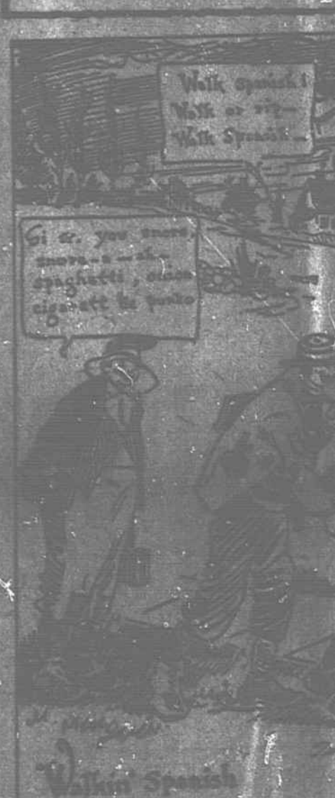
Walk speak! Walk speak! Walk speak!