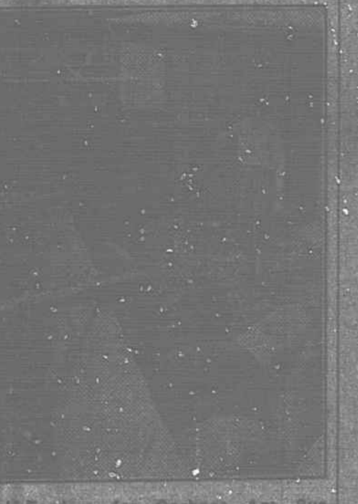
Self-Feeders for Garbage Are Successfully Used in Some Instances, but Are Not Generally Recommended Because of the Difficulty in Keeping Them Sanitary.

Hogs which are to be fed garbage should be immunized against cholera by the double or simultaneous treatment. Thorough permanent immunization is very important because of the presence of raw pork scraps from in-