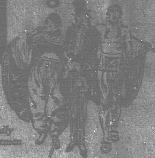
Three Friendly Gentlemen