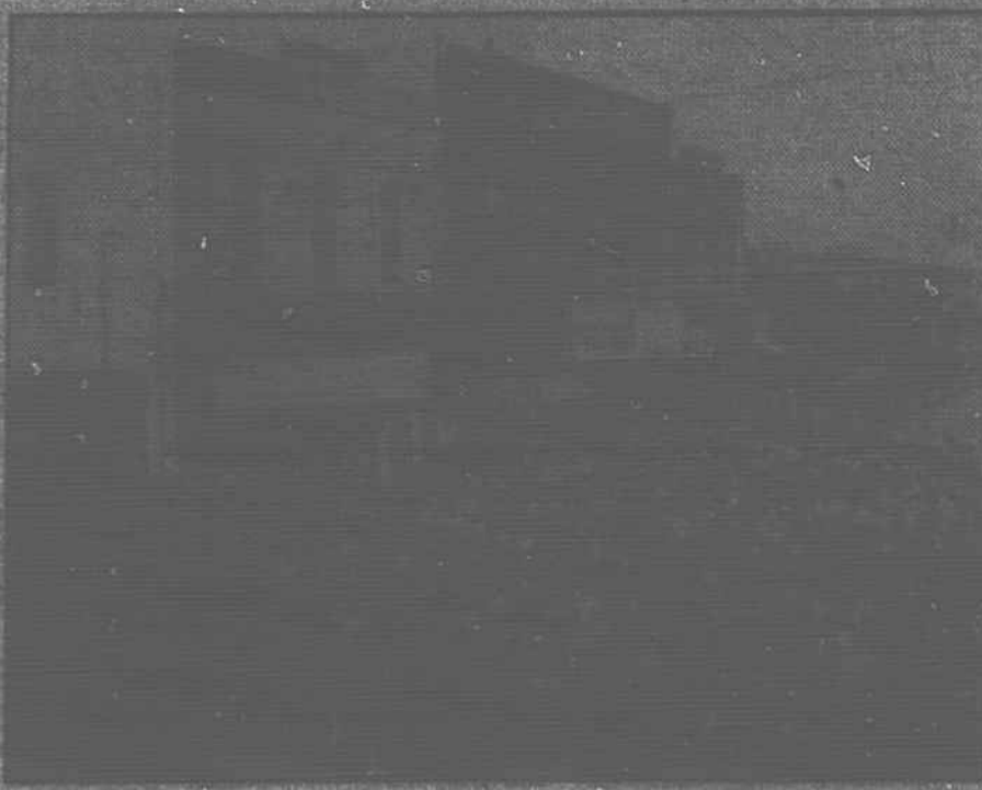
PICTURE OF CROWD ON MAIN STREET LAST YEAR AT DRAWING OF PRIZES GIVEN AWAY BY THE TURNAGE CO.

Just in case you planned to send in a check for your subscription to The Enterprise, we thank you; we would not do anything to change your mind.