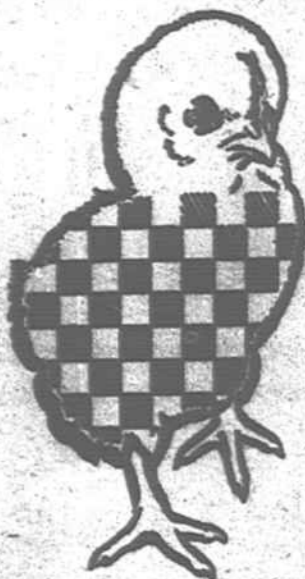
Baby Chicks Every Wednesday DAVIS SUPPLY CO. Farmville, N. C.

Unique race living high in the Andes is described as scientists.